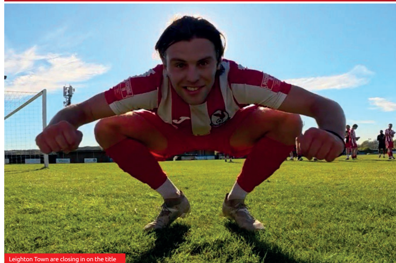
Leighton Town are closing in on the title

This is one of two divisions where the title race is still open, but Leighton Town are on the verge of claiming it as they return to home action with the visit of already-relegated Rayners Lane. Behind them, Hitchin Town also have home advantage this weekend as they do battle with mid-table MK Irish.