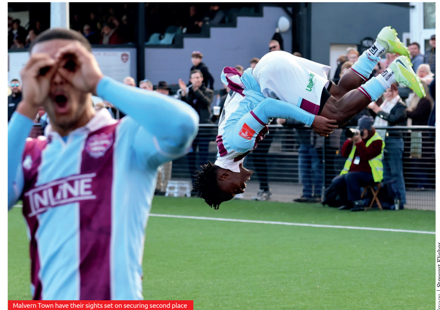
Malvern Town have their sights set on securing second place