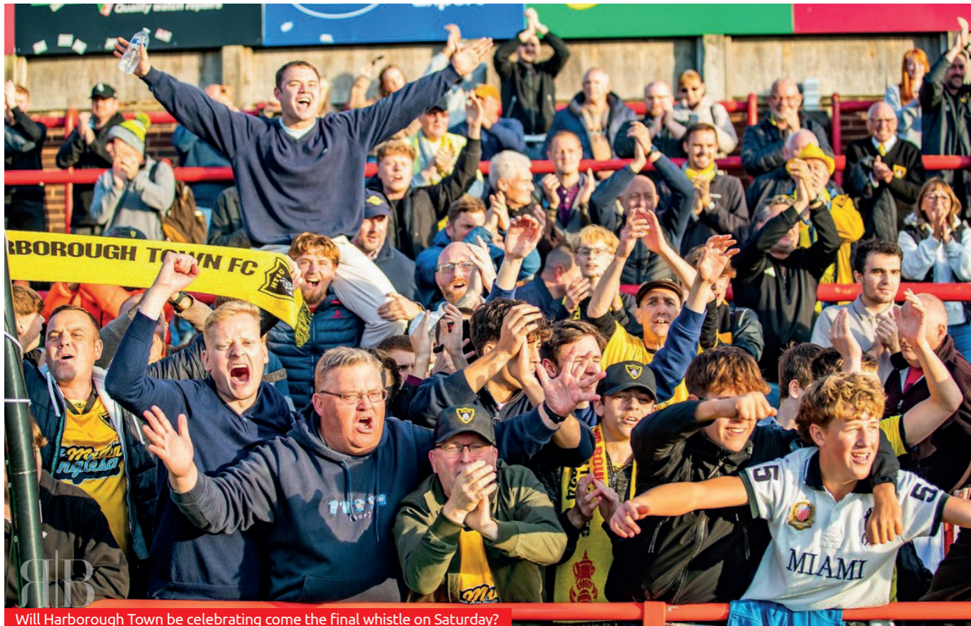
Will Harborough Town be celebrating come the final whistle on Saturday?

"We know there's still work to do to finish it off but I'm confident we can get over the line."