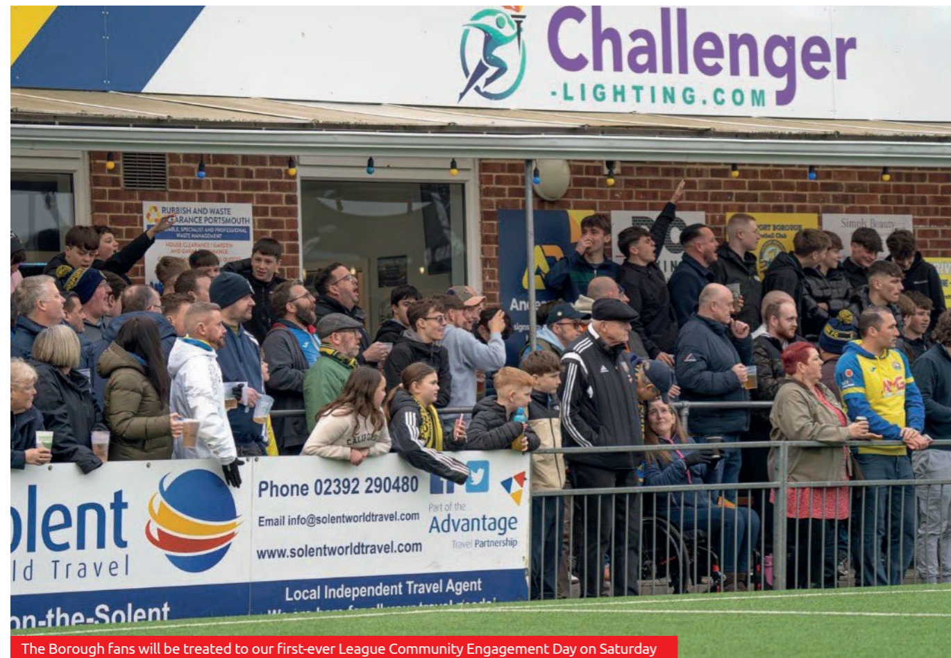
The Borough fans will be treated to our first-ever League Community Engagement Day on Saturday

League we are committed to being an inclusive, diverse and equal organisation.