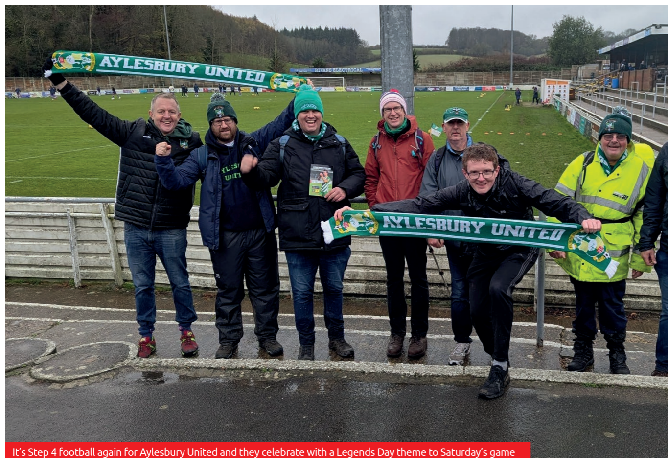
It's Step 4 football again for Aylesbury United and they celebrate with a Legends Day theme to Saturday's game

"You have to fight hard for every point. Another thing I've been so impressed by is the fans of each team; they are so passionate and have a genuine love for their team. It's great to see and always good to play in front of.