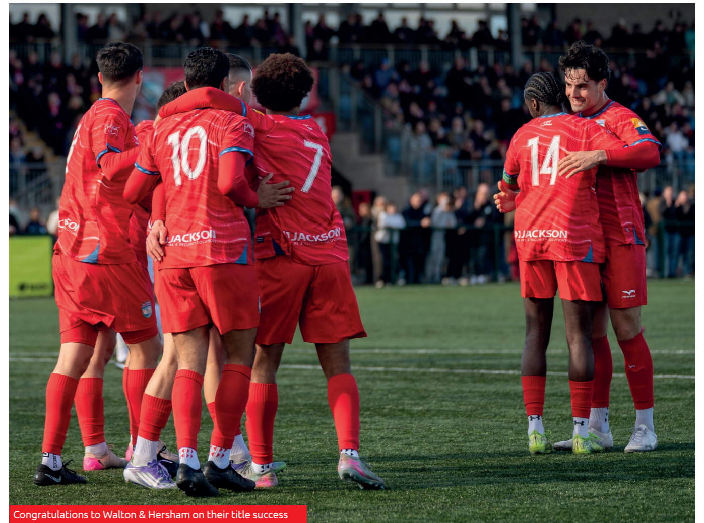
Congratulations to Walton & Hersham on their title success

Monday was a bad day for the leading pack as no fewer than five of the top six all suffered defeat as the pressure ramps up a notch or two.